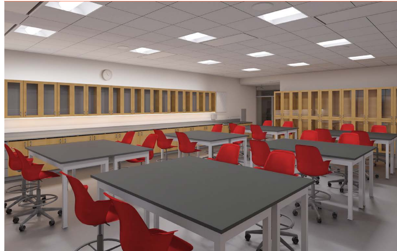
View of typical laboratory