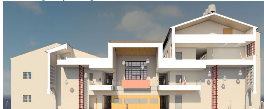
Section through lobby, Looking west