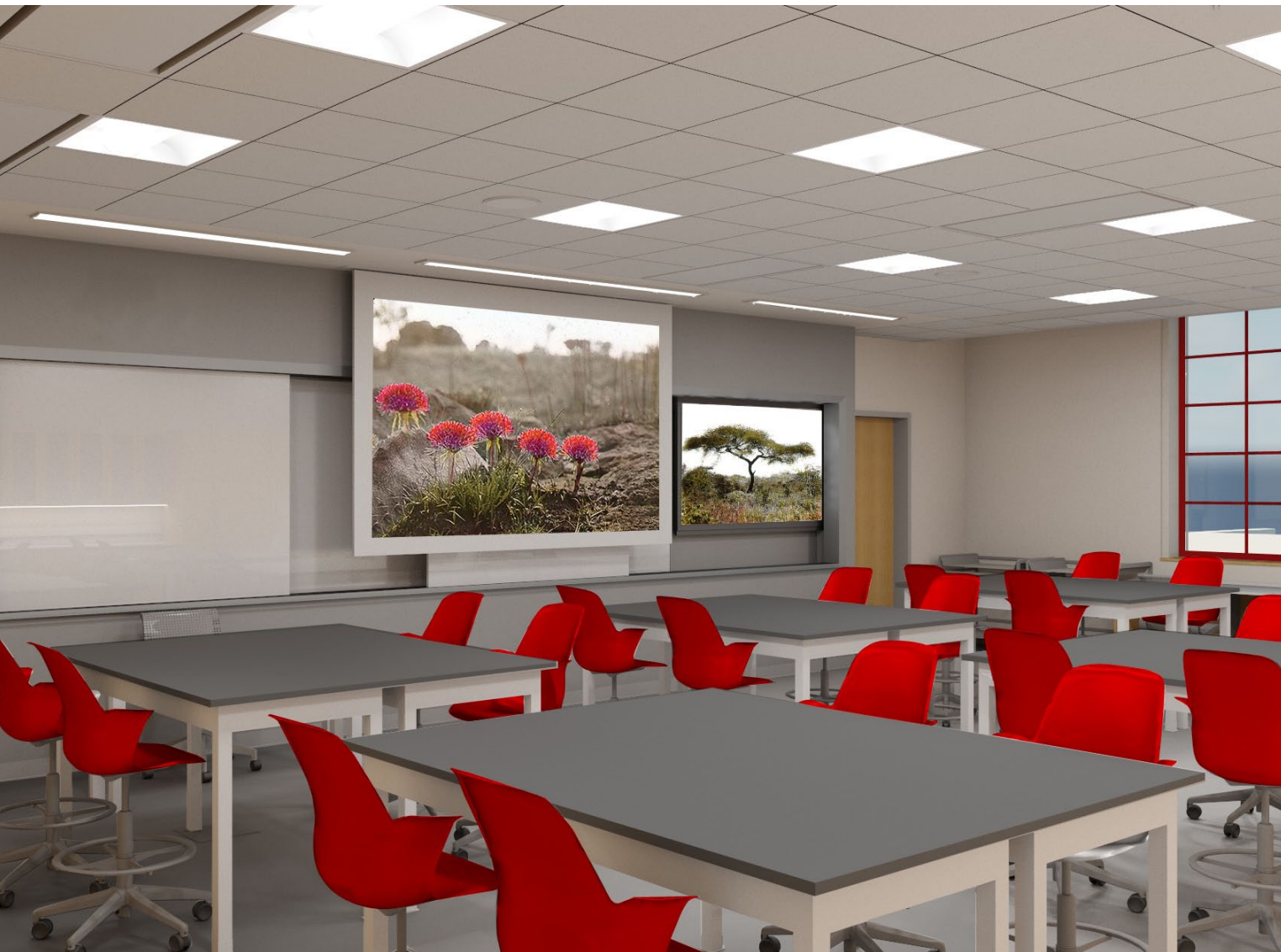
View of teaching wall